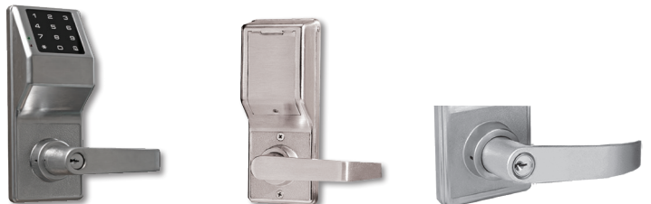
With IC Core in 26D TDL2700IC/26D