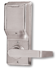
Secure battery compartment on inside door