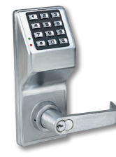
With IC Core in 26D DL2700IC/26D