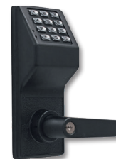
NEW! DL2700/19 Matte Black