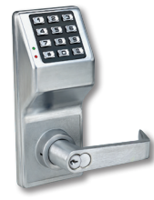
With IC Core in 26D DL2700IC/26D