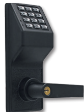
NEW! DL2700/19 Matte Black